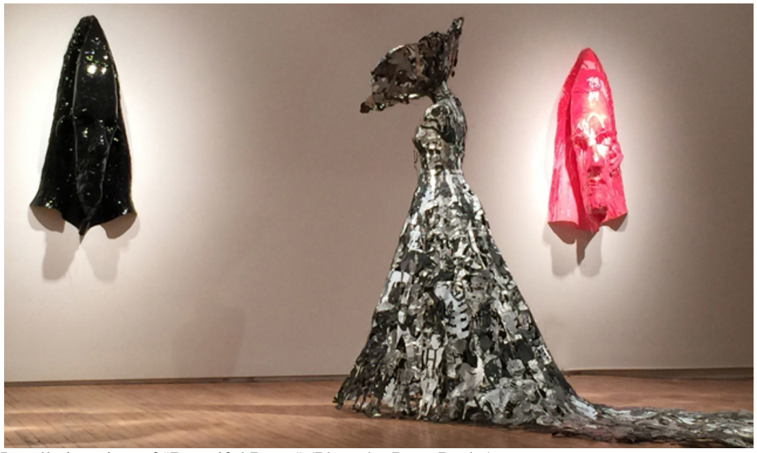
Installation view of "Beautiful Beast"

When I have a full-throated idea, I feel as if I am teaching, bit by bit, my team to sing the same song that I am singing, so that we have this group hum, and we are making the work from that kind of atmosphere.