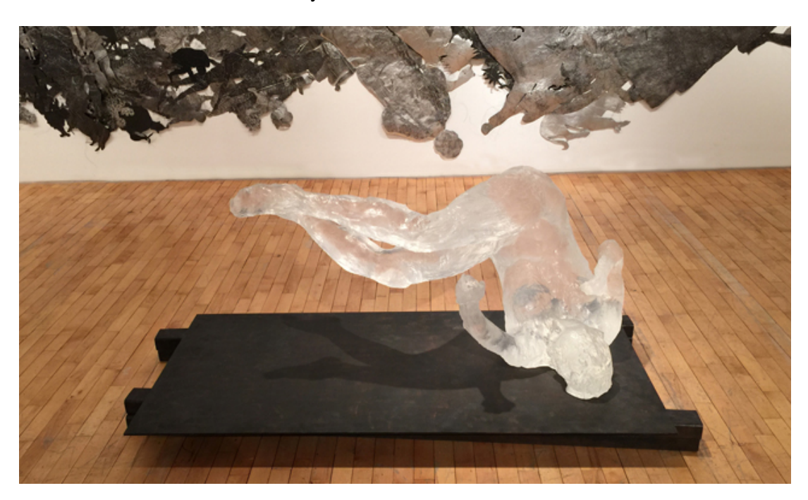
Eric Fischl's "Tumbling Woman II," 2015.

Certain works in sculpture which give the impression of completely erasing any trace of the human hand are the exact opposite; requiring countless hours of tedious labor to achieve the look of a machine made thing. Ultimately, any artwork, regardless of its mode of creation, is the product of artistic intentionality — a question of individual intentions, aesthetics, and conceptual concerns. It's not the how, but the why?